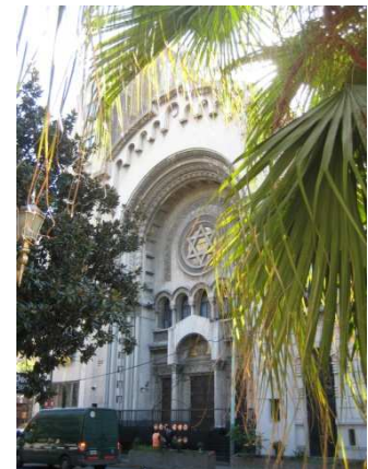
Main synagogue in Buenos Aires

Both visits were very successful. In Brazil ICCJ reconnected with many colleagues and friends. In Buenos Aires it was made clear that the infrastructure for having the 2014 ICCJ conference in Argentina is available. It is now up to the ICCJ Executive Board and the Board of the Argentinian Council of Christians and Jews to decide when the 2014 conference will take place. As soon as the dates are known, we will let you know.