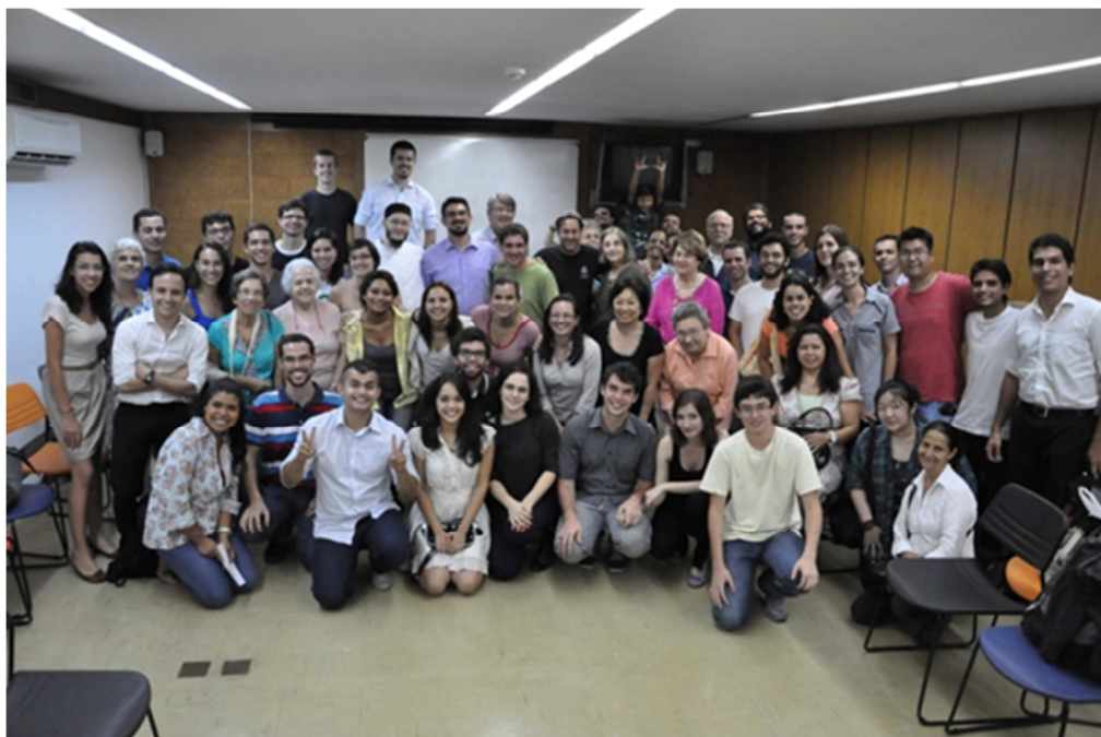
Meeting in Sao Paulo with youth group.