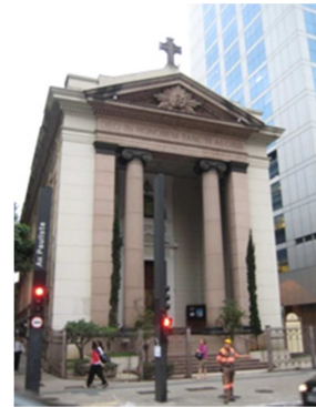
São Luis Parish Church, Avenida Paulista, São Paulo