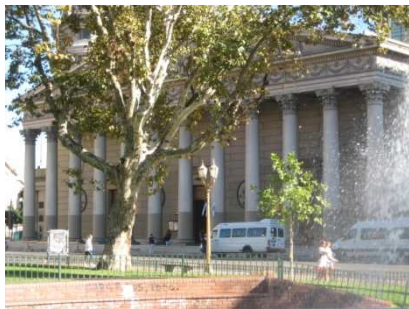
Plaza de Mayo: Cardinal Jorge Bergoglio's (former) Cathedral.